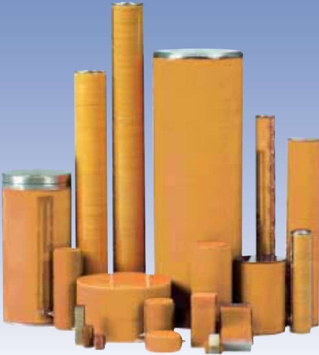
Variety of standard and custom PICA-Stack piezo actuators.