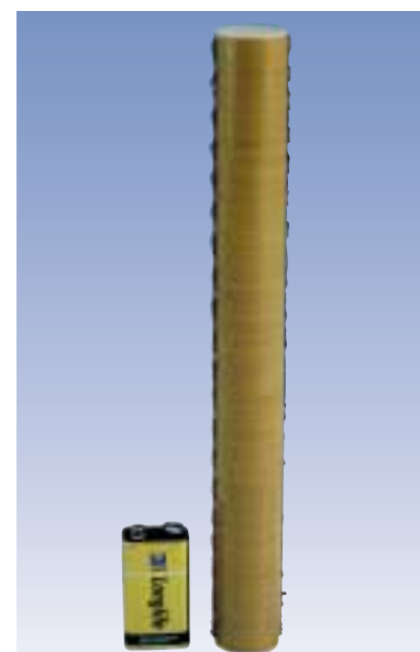
Custom PICA-Stack actuator with 350 µm displacement.

PI offers a wide range of control electronics for piezo actuators (see page 28 and www.pi.ws ) from low-power drivers to multi-channel, closed-loop, digital controllers. Of course, PI also designs custom amplifiers and controllers.