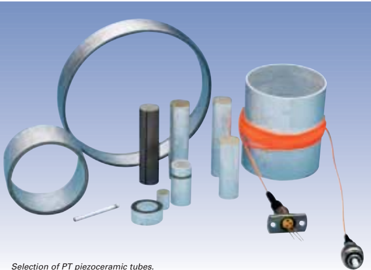
Selection of PT piezoceramic tubes.