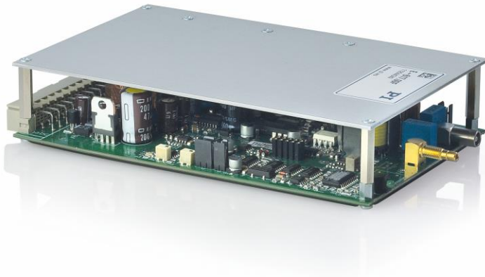
E-617.00F OEM module